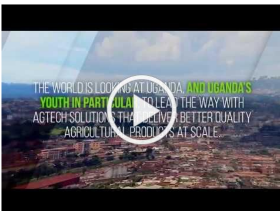
LEAD UG was designed by Common Ground

For the past five years, Common Ground has been working in Uganda on behalf of USAID's Feed the Future Enabling Environment for Agriculture Activity (EEA)—a program designed to strengthen agricultural development, trade, and adaptation to climate change. Over the years, our work has evolved and deepened in ways we never imagined. Asked initially to provide advocacy training and partner assessments, over time we've been provided with a tremendous amount of autonomy to engage with the EEA team on the development of new initiatives, creative problem-solving, and pushing local partners—including government officials—to